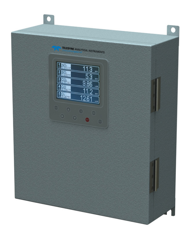
NEMA-4 Wall-Mount Configuration

The concentration of the desired gases is displayed on a large, easy-to-read back-lit LCD. The user interface is very intuitive and the menu / mode selection buttons, which are readily accessible, provide the operator with dynamic control and extensive diagnostic capabilities.